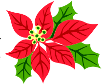
Season's Greetings from staff & council!

Remember to water your tree and use extra caution with candles.