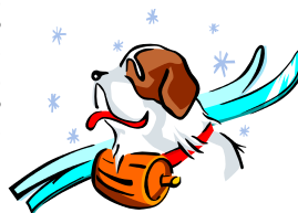
Be prepared now!

living supplies and services. They will be busy assisting with resolving the situation causing the declaration of an emergency. You need to have a fully