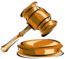
This meeting is called to order...

The Council of the Village of South River will be discussing budgets at their regular council and committee meetings until they are passed. Council meets regularly on the second and last Monday of each month at 5:30 p.m. in the council